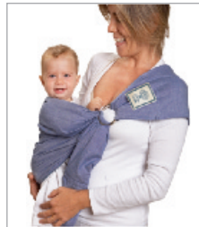
Lots of different carrying positions, suitable up to 15-20 kg. Instructions for use can be found inside packaging.