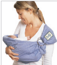
Practical for breast feeding.