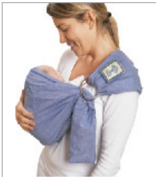
Cradles and is as cosy as mummy's tummy.